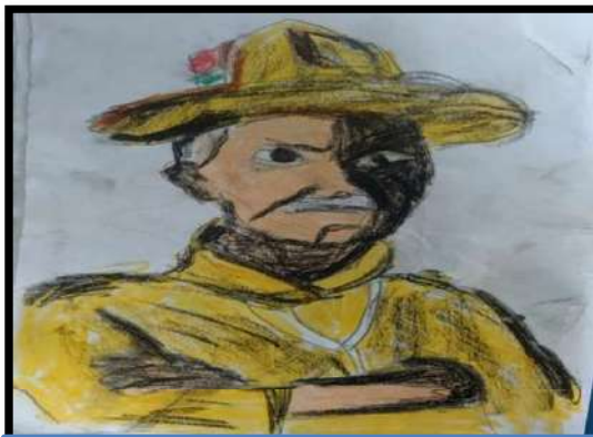
PIYUSH SARMA CLASS - II