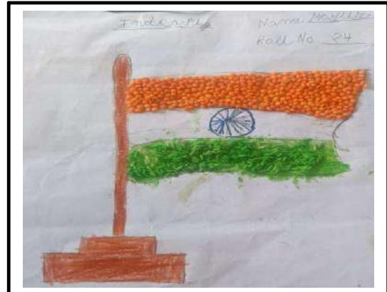
MAYUR DEV CHETRY CLASS - I