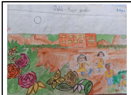
ANUSHREE KOTOKY CLASS -III